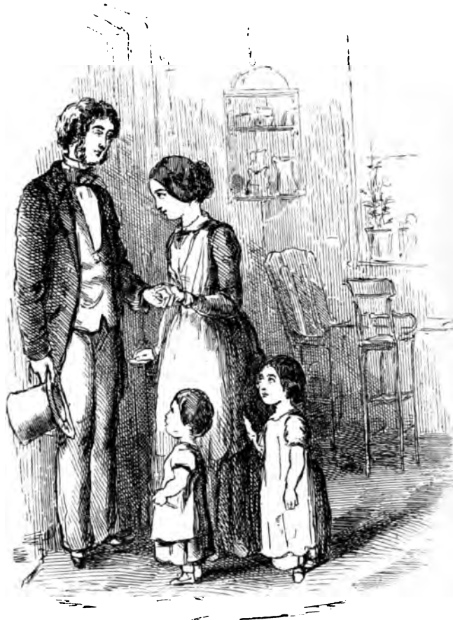
A VISITOR AT SHEPHERD'S INN